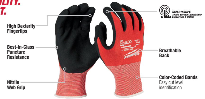
Cut Level 3 Nitrile Dipped Gloves