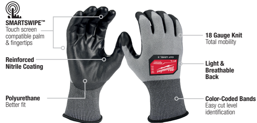
High Dexterity Cut Level 3 Polyurethane Dipped Gloves