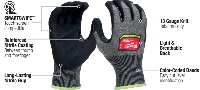
High Dexterity Cut Level 9 Nitrile Dipped Gloves